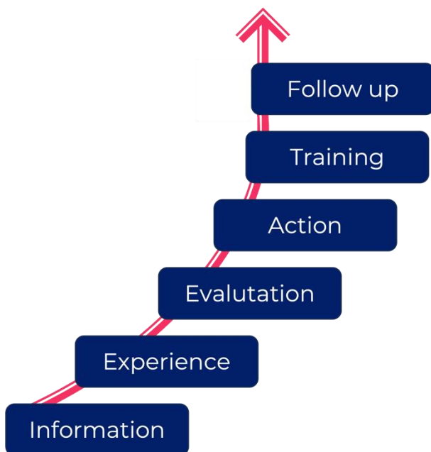
The staircase model for information transfer and processing of values and attitudes

We run both open and in-house training courses. Knowledge is the basis for fact-based decisions and a prerequisite for engaging management and staff. Knowledge is part of our approach to changing behavior. Simply providing information is seldom enough to make people act differently.